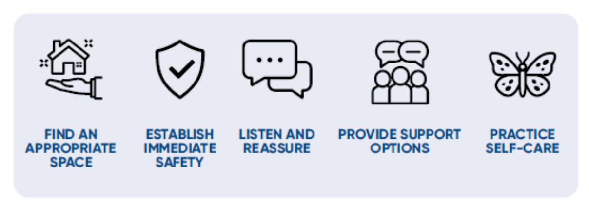
Figure 1. Initial Response to a Disclosure of Sexual Assault or Sexual Harassment

These steps are also outlined in a one-page reference, How to Support Some who Discloses Sexual Assault and/or Sexual Harassment (Appendix . Staff members are encouraged to download and familiarize themselves with these guidelines.